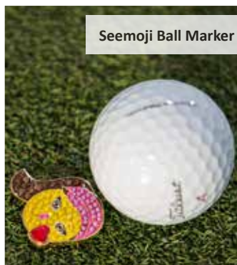
Seemoji Ball Marker

This spring season I encourage you to work on those three to four foot putts. Spend time on the greens and challenge yourself to get better. Before your round, make it a goal to spend 15 minutes on the putting green before heading to the tee; I guarantee you will see your scores start to drop. Make sure to check out my new "Seemoji" ball markers on Bonjoc to add sparkle to your game.